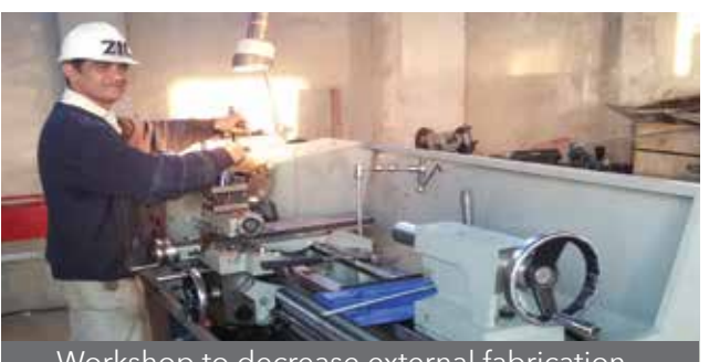
Workshop to decrease external fabrication and mechanical works cost